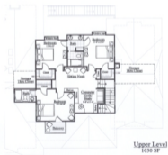
UPPER LEVEL 1030 SF